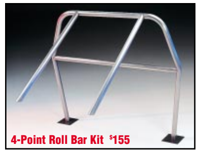
4-Point Roll Bar Kit $155

20240000 Swing-Out Side Bar Kit . . . . . $60.00