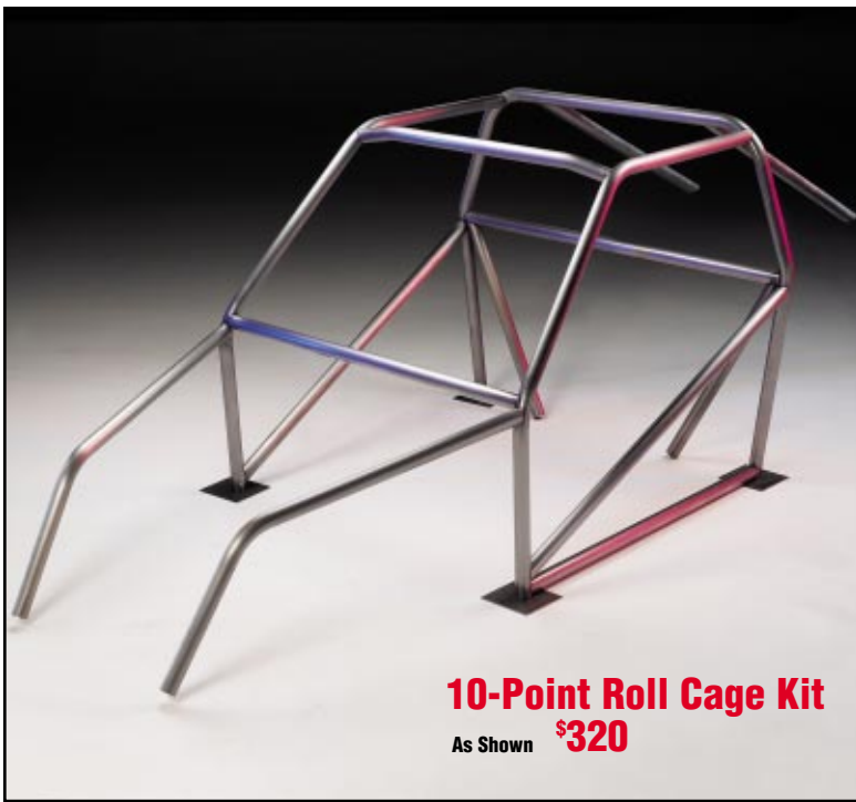
10-Point Roll Cage Kit As Shown $320